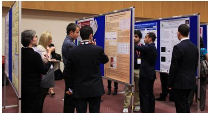
ICHAMS 2011 Poster Presentations