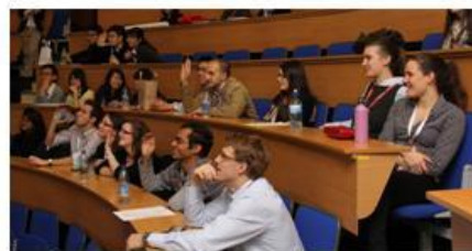
ICHAMS 2011 Workshop